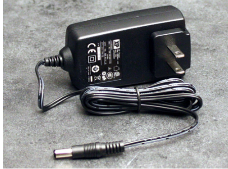
Power Supply PSWA-DC-24