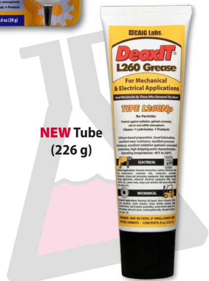
NEW Tube (226 g)