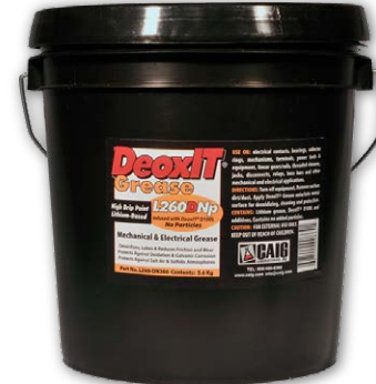
Small Pail (3.6 KG)