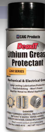
Sprays (10.0 oz / 284 g)