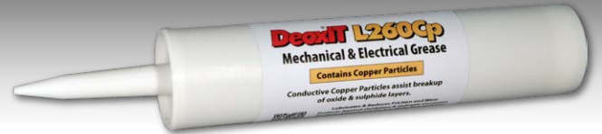
Caulking Tube (226 g)