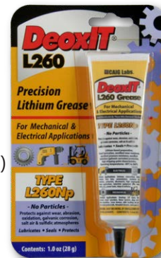
NEW Retail Tube (28 g)