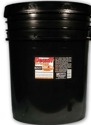
Pail (15.9 KG)