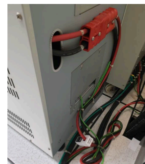
UPS Power Consumption Monitoring