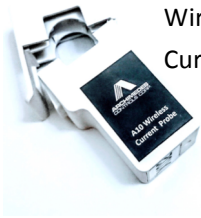
Wireless AC Current Sensor