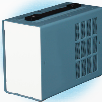
▶ Optional carrying straps