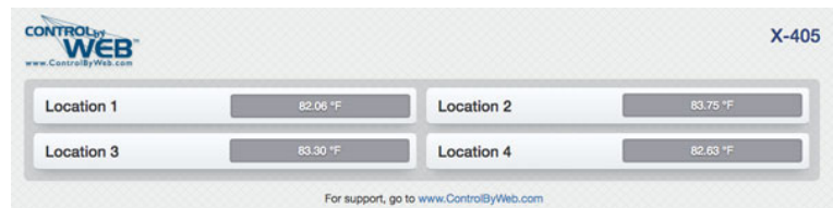
Example Control Page