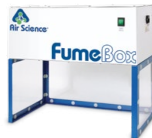
Fume Box AP60V